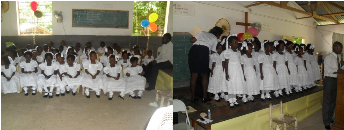
Kindergarten Graduation at Marechal School.